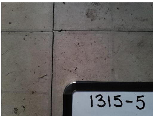
1315-5 12"x12" Floor Tile/Adhesive Interior South Bedroom