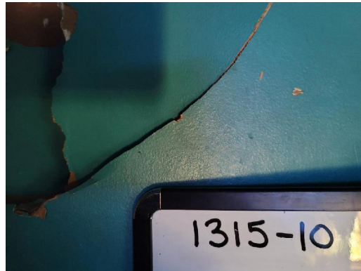
1315-10 Drywall/Joint Compound Typical Interior Walls/Ceilings