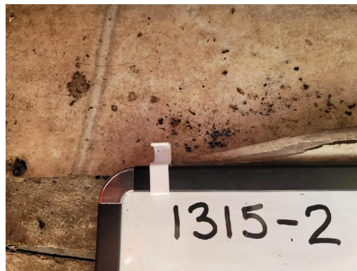
1315-2 Rolled Flooring (Top Layer) Interior Enclosed Porch