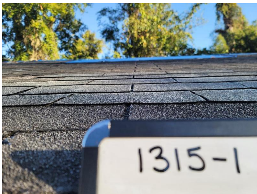
1315-1 Asphalt Shingle Typical Exterior Roof