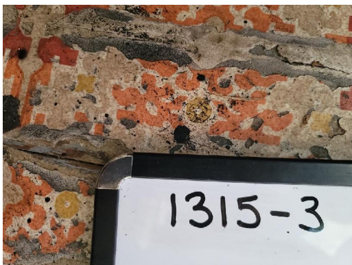
1315-3 Linoleum/Red (Bottom Layer) (10% Chrysotile) Interior Enclosed Porch (Appx. 30 sf)