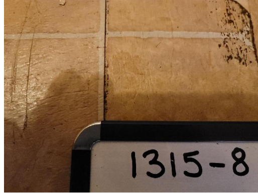
1315-8 12"x12" Floor Tile/Adhesive Bathroom (Top Layer) Living Room (Bottom Layer)