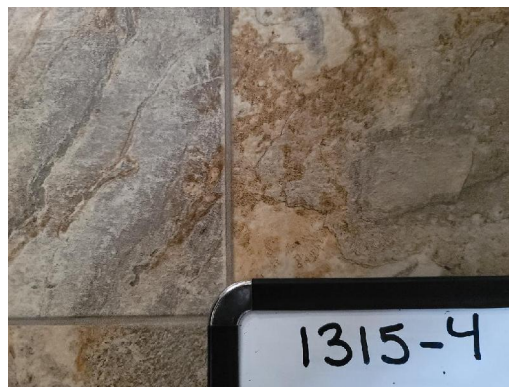
1315-4 Rolled Flooring Interior Living Room/Kitchen/Hall (Top Layer)