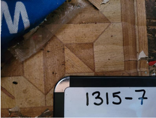
1315-7 12"x12" Floor Tile/Adhesive Northeast Bedroom