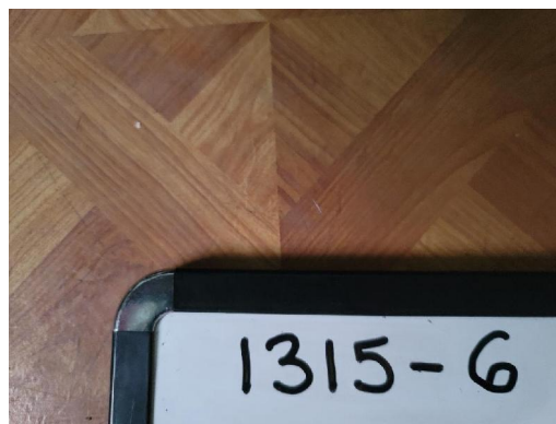
1315-6 12"x12" Floor Tile/Adhesive Interior Southeast Bedroom